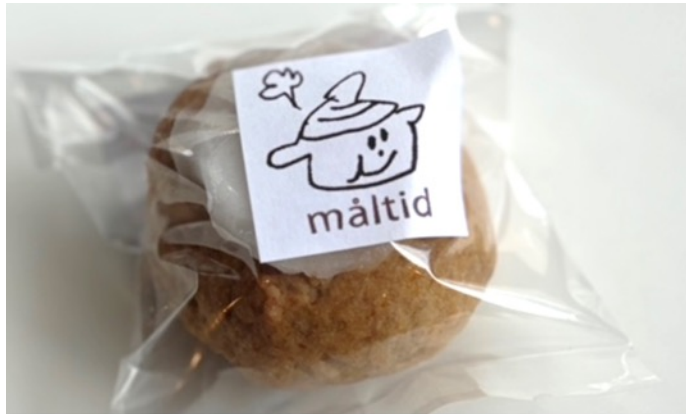
Russian traditional cookie