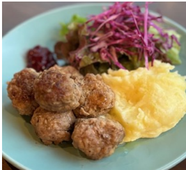
Swedish meatballs with lingonberry jam ...¥880