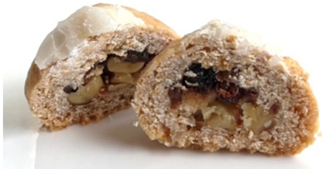
Russian cookie with raisins and walnuts in dough kneaded with sour cream and honey